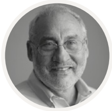
Joseph E. Stiglitz

Our contributors make up an esteemed group of statesmen, economists, and analysts.