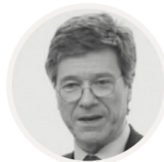
Jeffrey D. Sachs

Professor Emerita of Politics and International Affairs at Princeton University, former Director of Policy Planning in the US State Department, and CEO of the think tank New America